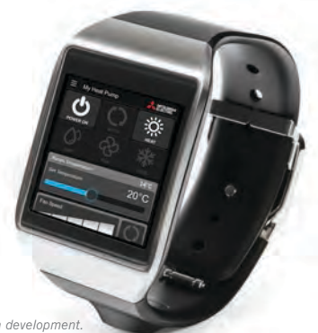
Smartwatch app currently in development.

Adjust the intensity of the fan speed and choose a specific direction or swing.